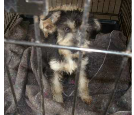
Little Jerry, only 4 mos old, in Galveston Co. kill shelter rescued by

We know that there were many people who not only transported on behalf of MSRH during the first 4 months of 2009, but many who took part in the adoption process, as well, which included visits to the potential adopters' homes. Since the adoption process is spread among many, we will not attempt to name names in our thanks for that, only because we run the risk of omitting someone, which we definitely do not want to do. We thank all of you for your effort always and forever!