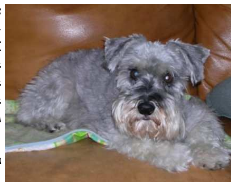
Petie relaxing on the couch.

Right now at bedtime I sleep on the loveseat in my foster mom's bedroom. She gets up during the night to take me to "use the facilities", but if you decide to take me to your forever home and that's inconvenient for you, I can take care of that night time potty