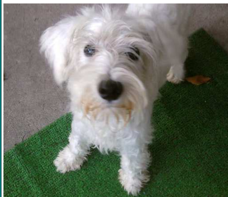
Rowdy—a ball of energy!