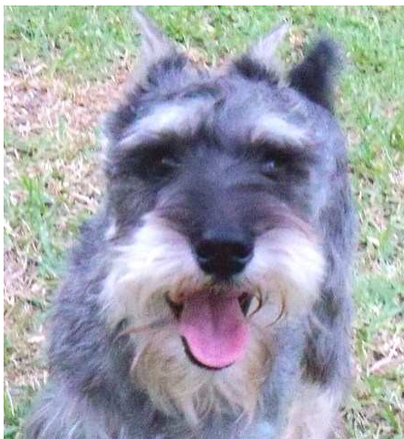
Pierre—loves to sit in your lap!

Hi! I'm Pierre. I'm a male salt and pepper Miniature Schnauzer with cropped ears and a docked tail. I'm three years old and weigh 18 lbs. I love to sit beside you or in your lap where you can pet me. I love my adult human friends, but get a little nervous around children, so an all-adult home would probably be best for me. I also get along well with other dogs and can play well in a group. I am crate trained and about 90% house trained. I can use a doggy door. I love to chew on a bone, and I must be honest, I like to bark.