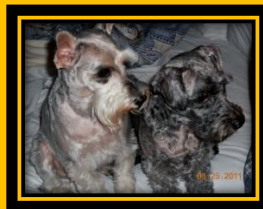
Jake and Tiger 2 of my “kids”