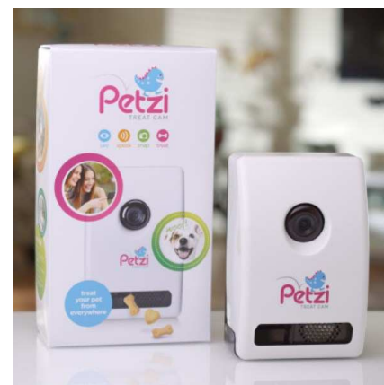
Petzi Treat Cam