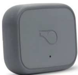
Whistle 3 GPS Tracker & Activity Monitor