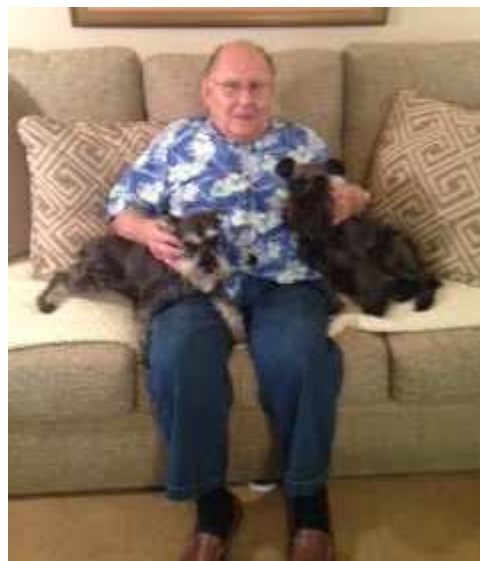
Lil Bit (on left) and Kolby with Dad.

Here we have Kolby with his little sister, Lil Bit. After a few weeks adjustment last summer they have become friends although are still jealous at times. Both dogs frequently join in for an early morning chase of two squirrels in their backyard.