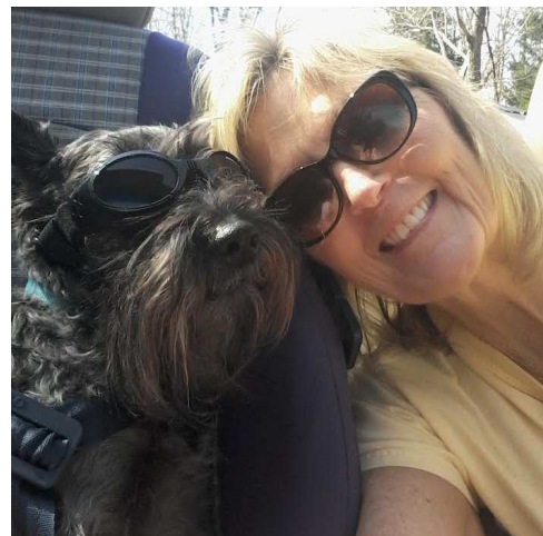
Barney in his cool shades riding in the convertible with Mom.