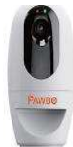
Pawbo Life Wi-Fi Pet Cam