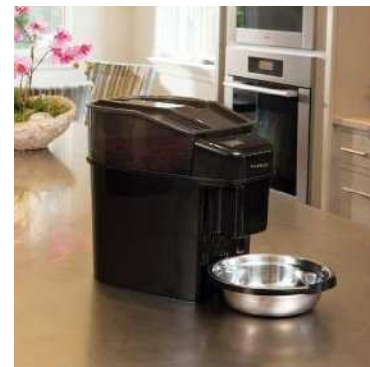
PetSafe Healthy Pets Simply Feed