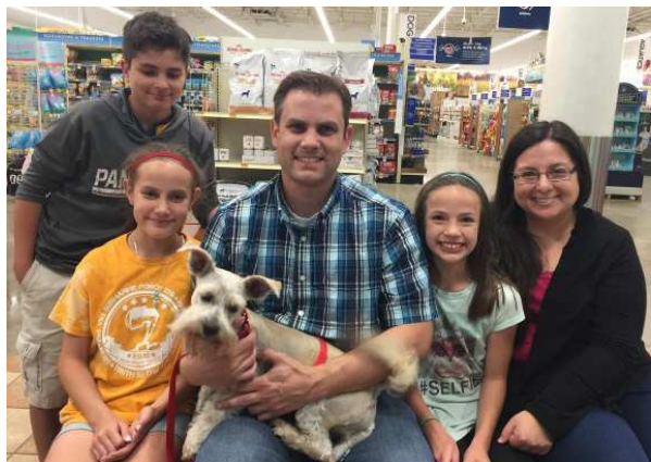
Freckles with his new family.