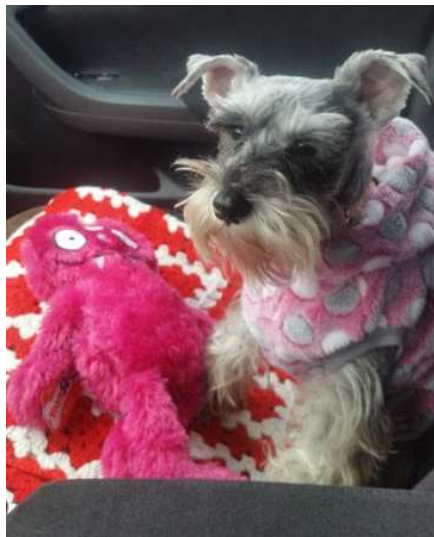
LauraLeigh Kay going on a car ride.