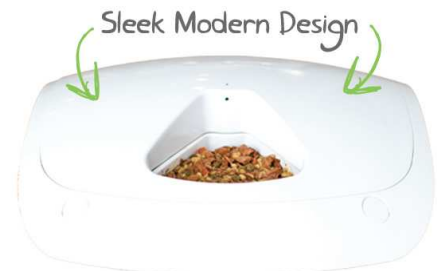
Feed and Go Pet Feeder