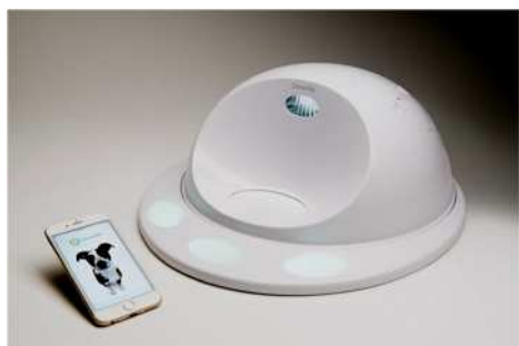
CleverPet Hub with Smartphone App