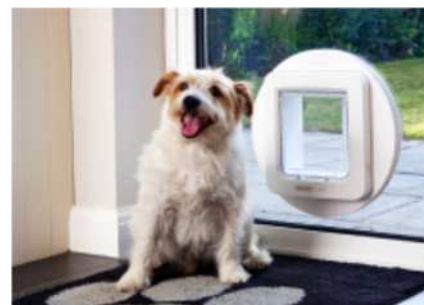
SureFlap Pet Door Installed In Glass

is that this door is meant to restrict which pets can come in. Any animal can go out. The way it works is that there is a ‘tunnel’ facing the outside. When a pet sticks his head in the tunnel, sensors in the tunnel attempt to read the pet’s chip or the RFID pendant. If it can, it unlocks the door, so the pet can come in. This door comes in both white or brown to match your décor. The white door costs $150.00, while the brown one costs $171. You can purchase it and all accessories at Amazon, Chewy, and Petco. Out of 156 Amazon reviews, 60% were 5-star, and 15% were 4-star. For more information, go to www.sureflap.com/en-us/pet-doors/microchip-pet-door .