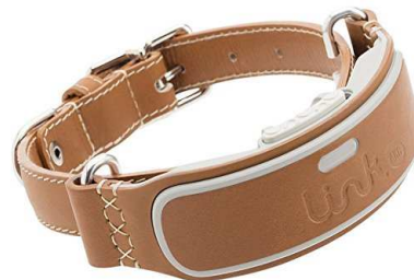
Link AKC Smart Collar