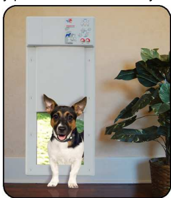
PX-1 Power Pet Door

traditional doggie doors leave your home vulnerable to intruders, stray animals, and weather, this state-of-art pet door opens only with the sensor from the coordinating High Tech Pet Microsonic collar. As your pet approaches, the door quickly and quietly opens upwards, meaning your pets no longer have to push through swinging flap type doors. The automatic deadlock keeps it extra-secure, and custom settings allow you to adjust the inside and outside range, allow “in” only or “out” only or both ways. It comes with an A/C adapter, but we prefer using the proprietary rechargeable battery with charger. We got an extra battery, so that when the battery in the door needs recharging, we’ve already got another charged battery ready to pop in for uninterrupted operation. The door comes with only one collar, but if you have a multi dog household, you can buy additional collars. It’s really the transmitter on the collar that you need, though. The actual collars are cheesy. We made our own more attractive collars and then threaded the transmitter on to it. You can find supplies to make your own collar at www.countrybrookdesign.com/ .