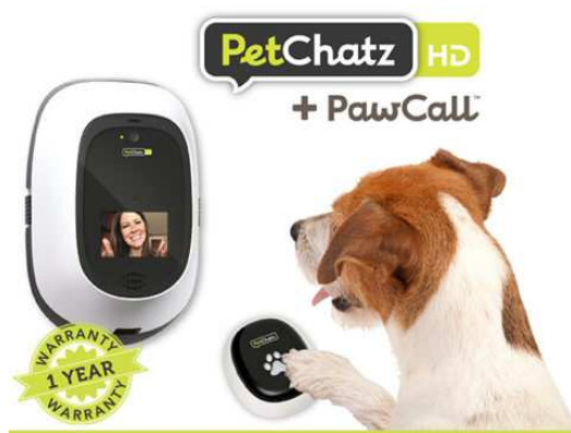
PetChatz HD with Paw Call

PetChatz video camera and accessories at either Amazon or directly from PetChatz. Out of 148 Amazon customer reviews, 76% were 5-star. Check this out further at www.petchatz.com .