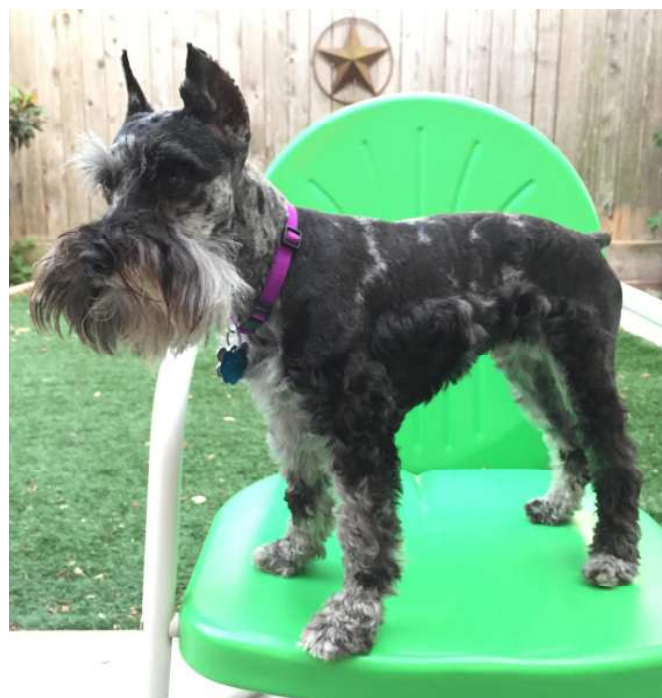
Mercury enjoying a summer day in the backyard!