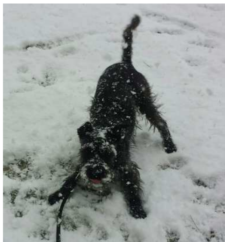
Rex lovin' to play in the snow!